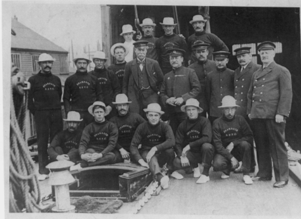
Sir Thomas Lipton with the crew of Stamack IV